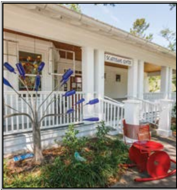
Traditional Gullah bottle tree captures evil spirits and keeps them from entering the Artisan Center.

and craftsmen. Each South Carolina artist is carefully selected through a professional juried process to ensure that the rich history of the state is kept alive.