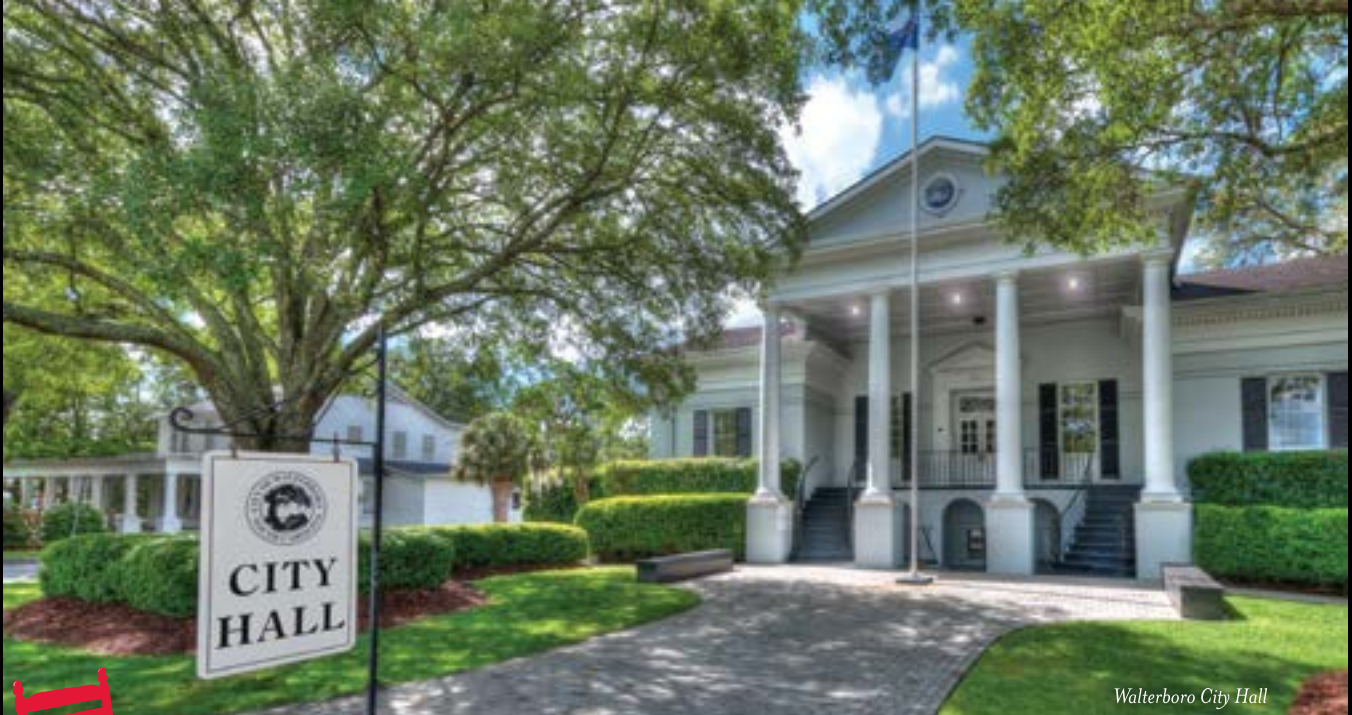
Walterboro City Hall